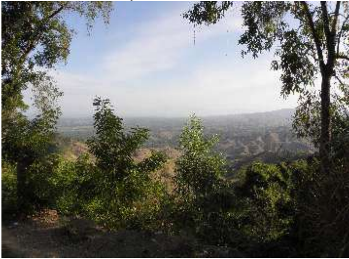
On an Island, far away.....