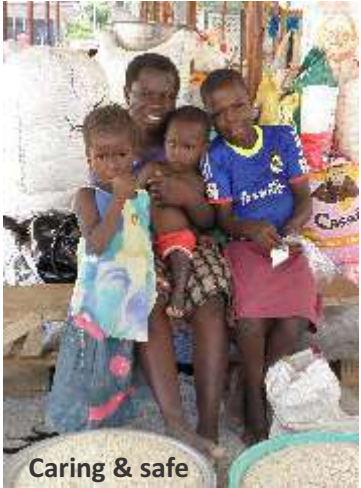
Caring & safe