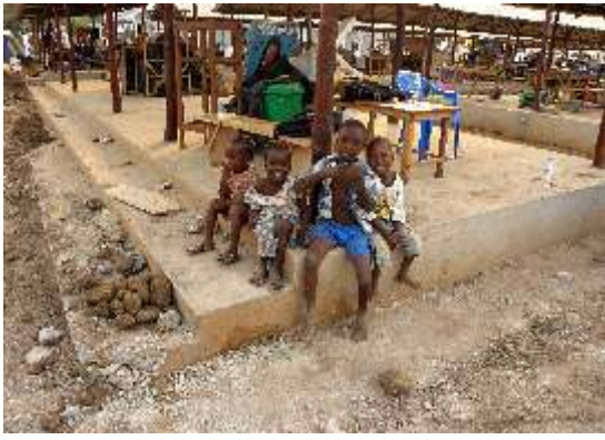
Affects all aspects of life, including family