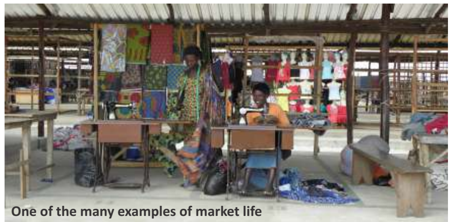
One of the many examples of market life