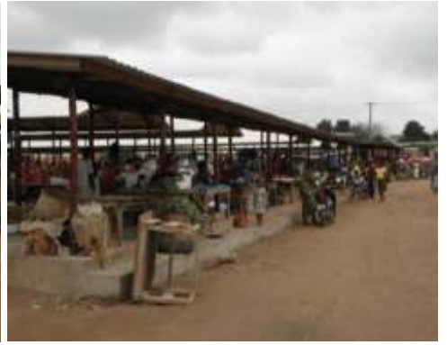
Main road approximately 0.5 Km with raised marketplace stalls