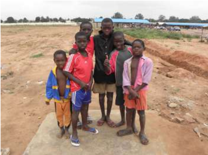
Literally raising people up from the dirt and dust