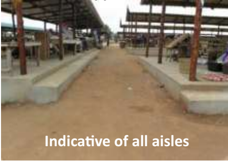
Indicative of all aisles