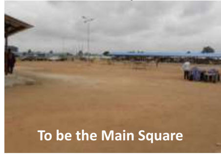
To be the Main Square